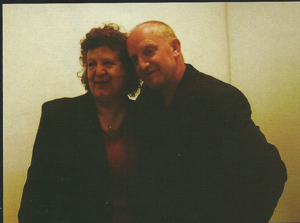
The Artist and the owner of Montserrat Gallery

Various journeys for study purposes to Scotland, Namibia, French, Eire, Norway, Spain, Greece, Persia, etc.