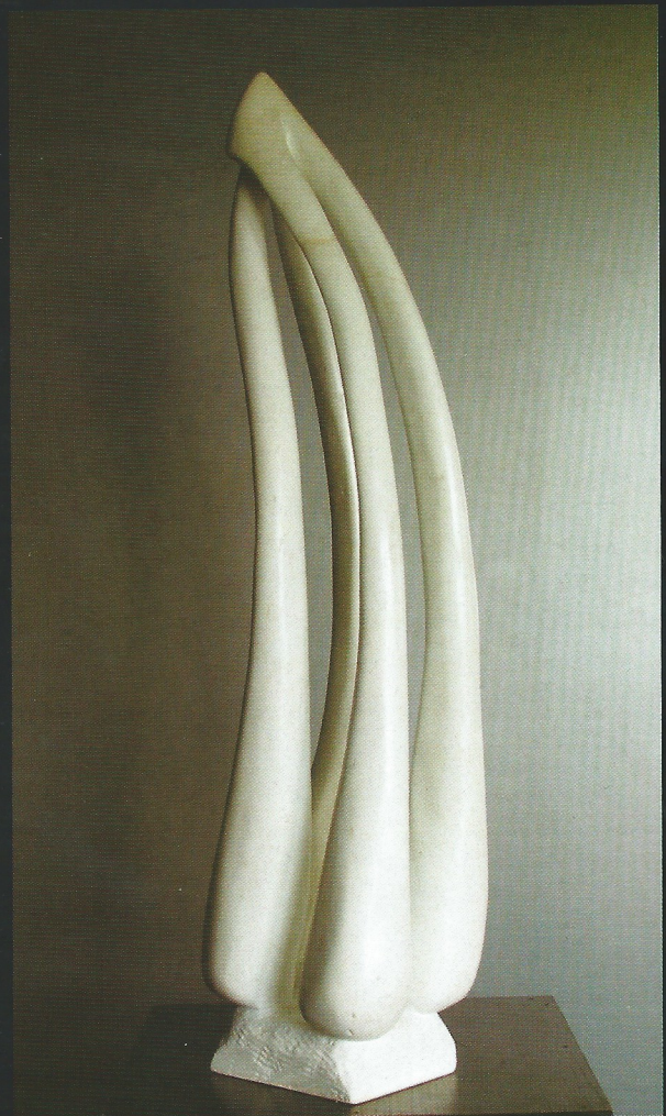
Human Forms, "free from", Thasos marble, 29.5 " high