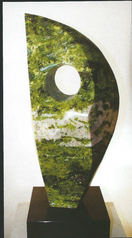
Norway's Landscape, Morud Serpentine, 29.6 " high